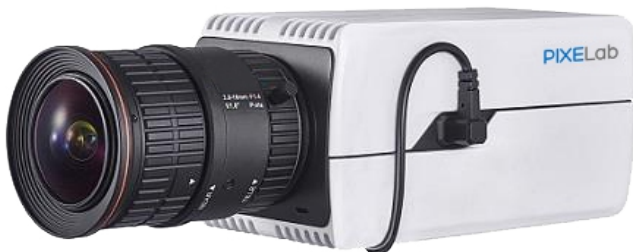
*item shown with optional lens