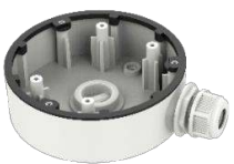
Junction Box (White)