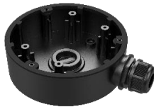
Junction Box (Black)